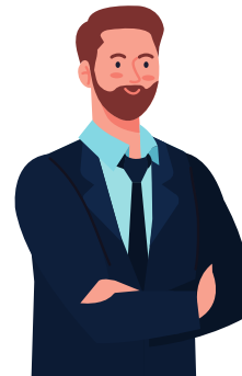
Speech Language Pathologist