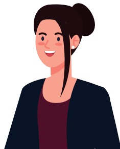
Administrators and Educators